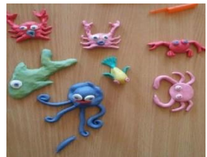
Art and Craft Pedagogy