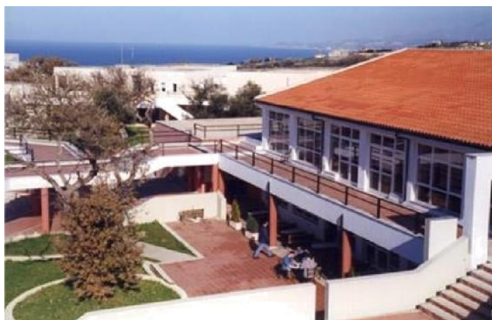
Pic 1: eLearning Lab

eLearning Lab Location: University of Crete, eLearning Lab, Department of Primary Education, 74100 Rethymno (Pic 1)