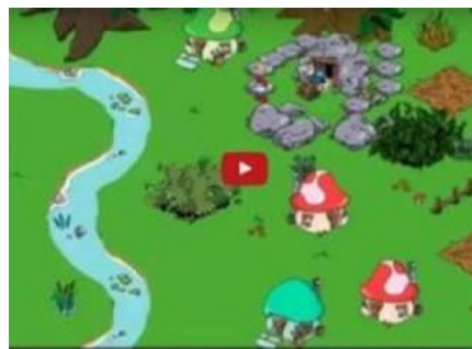
Animation / Digital Storytelling