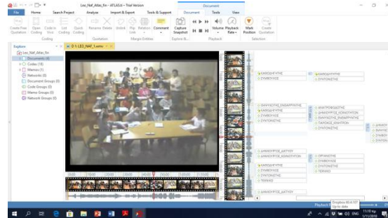
Analysis of videoconferencing via Atlas ti 8.0 software